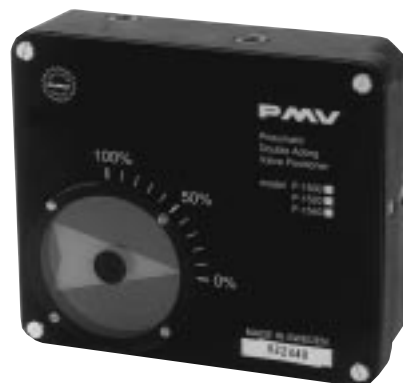
PMV pneumatic rotary positioner model P-1500.