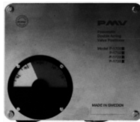
PMV pneumatic rotary positioner model P-1700.

A PMV I/P converter in a stainless steel field housing which easily mounts on top of P-1700 series is available.