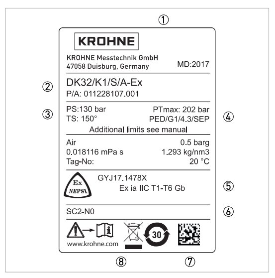
Figure 2-2: Example of nameplate

The type marking of the device is realised visibly with the nameplate shown below. The interior of the display has an additional marking with the serial number (P/A).