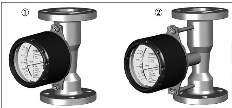
Figure 3-1: H250 M40 - indicator versions