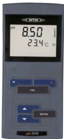
ProfiLine pH 3110