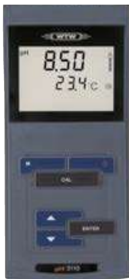
ProfiLine pH 3310